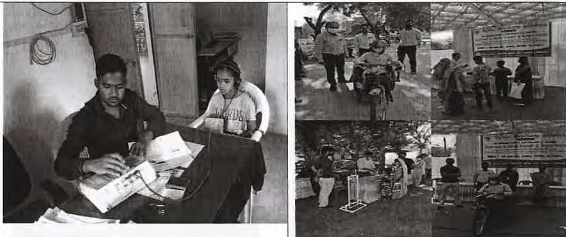
Distribution of Ration Kit to Contract Labour Community around PLL Dahej Terminal during COVID-19 outbreak.