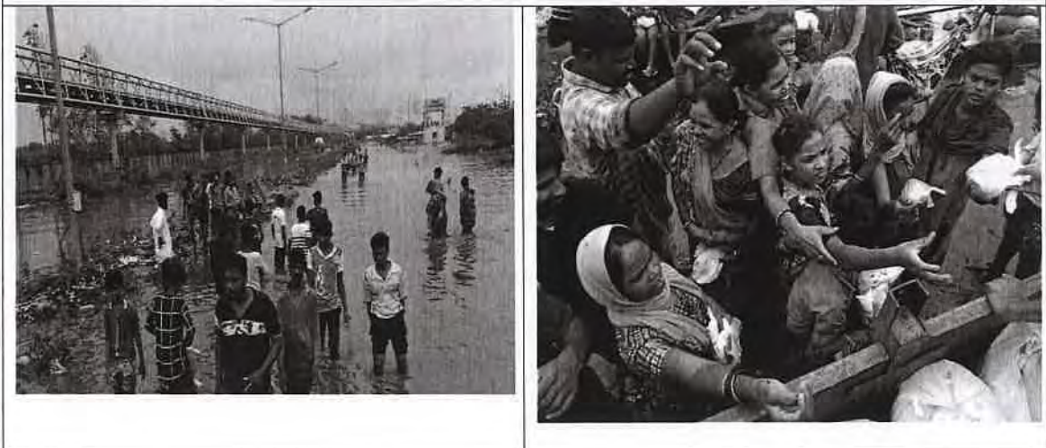
Volunteer Service by PLL Apprentice