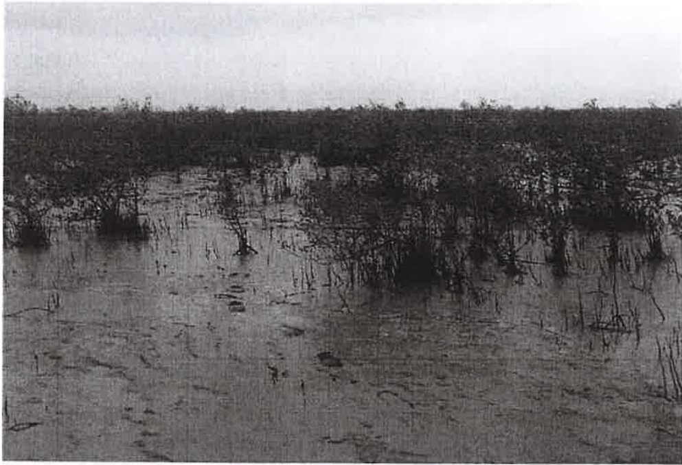
Mangroves planted in 50 ha. area at Gadhula, Talaja Coast during 2016-17