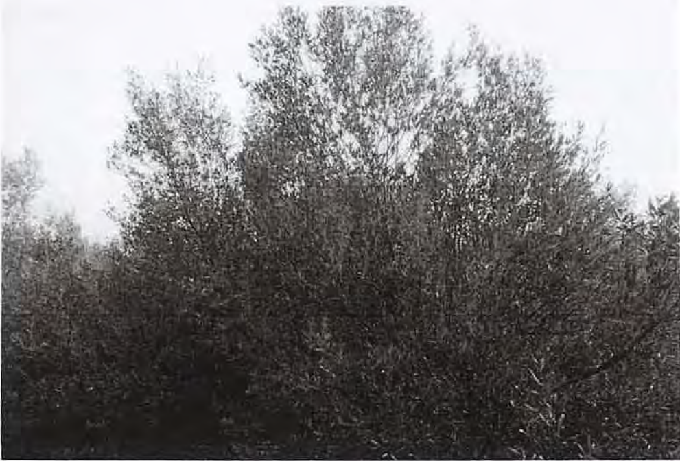
Mangroves planted in 100 ha. area at Ankalva Coast during 2010-11