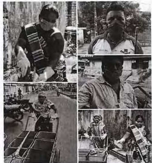
Mobile Health Unit (MHU) (Wockhardt Foundation)