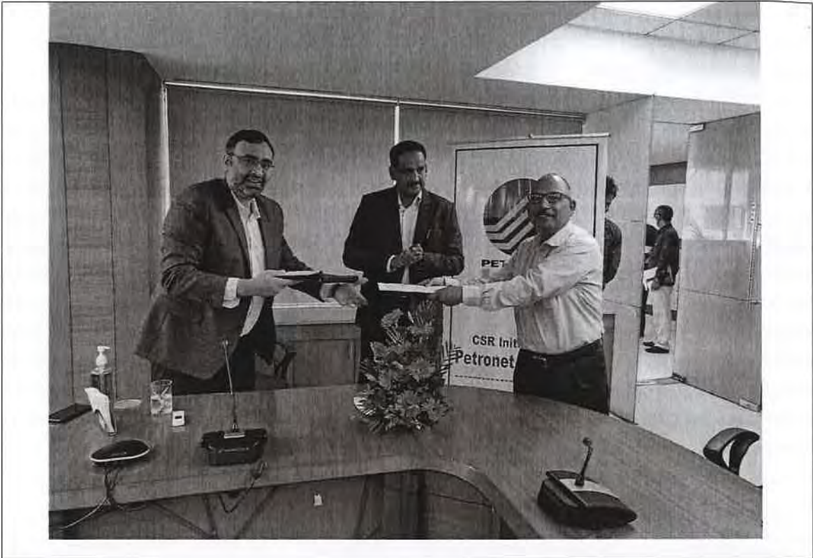
Flood Relief Activities