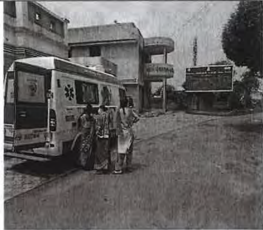
Distribution of PPE Kits and Masks in partnership with Rotary Club of Pune and Dahej