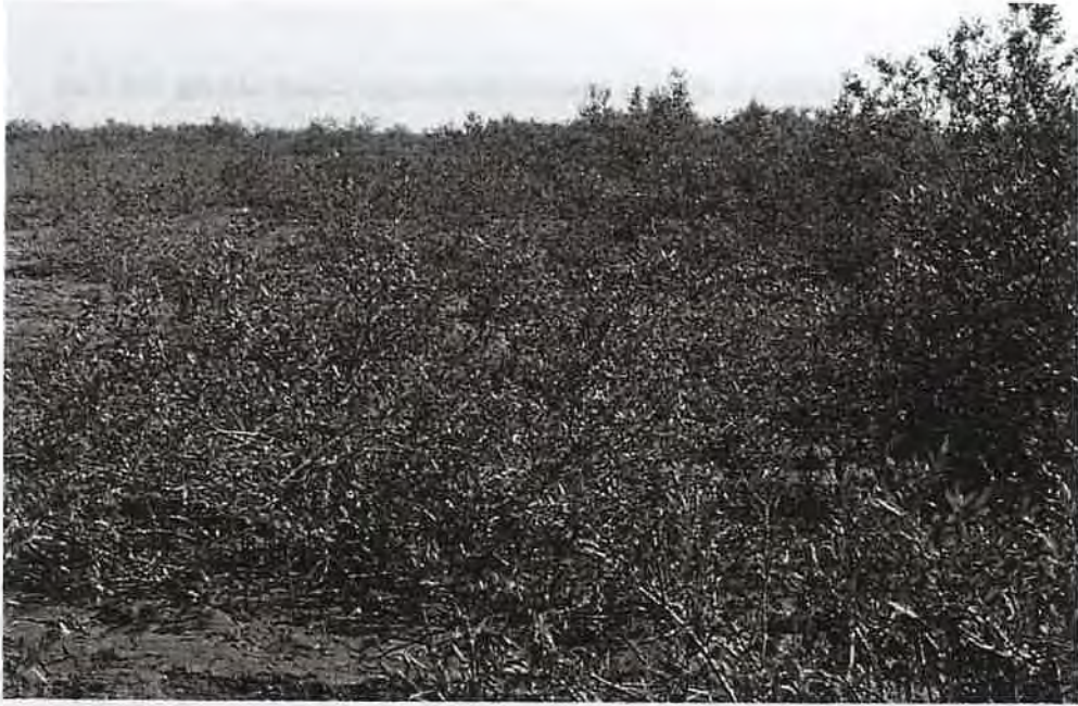
Mangroves planted in 100 ha. area at Bhavnagar Coast during 2012-13