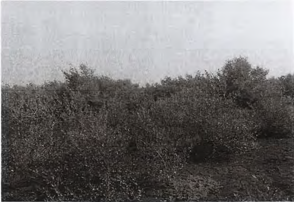
Mangroves planted in 200 ha. area at Ankalva Coast during 2012-13