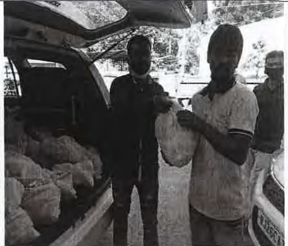
Distribution of Cotton Mask made by women welfare NGOs to prevent infection of COVID-19