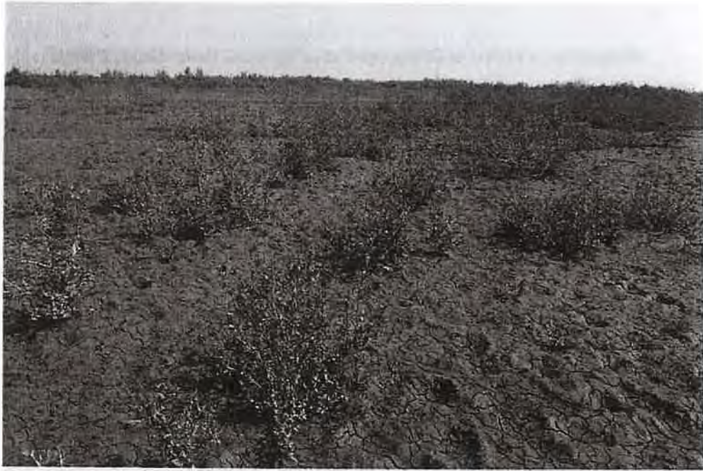
Mangroves planted in 200 ha. area at Bhavnagar Coast during 2014-15