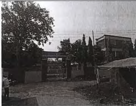
Development of Primary School at Luvara Village

PLL has signed a new agreement with CIPET, Ahmedabad to train 400 candidates in CNC Machine and Plastic Product Manufacturing. First batch of 50 candidate enrolled and initiated. PLL has signed agreement with Bharuch Nagarpalika to provide support for Disaster Management and Swachh Bharat Abhiyan, Bharuch Nagarpalika would procure one fire tender and Road sweeping machine with the financial support of Rs. 1.93 Cr. under PLL CSR Initiatives. PLL has signed an agreement with Gujarat CSR Authority (GCSRA) for construction of Panchayat Bhavan at Lakhigam village with financial support of Rs. 1.13 Crs.. PLL has supported Development of Green Zone beneath newly constructed flyover bridge at Bharuch City with financial support of Rs. 5.00 lakhs. PLL has supported development of Sports facility by Police Department, Bharuch with financial support of Rs. 5.00 lakh. PLL has supported Medical Equipments to Kasturba Hospital, Seva Rural Jhagadia with financial support of Rs. 5.00 lakh. PLL has provided support to Seva Yagaya Samiti for Strengthening of Facilities for Orphan/destitute Old Age Patients at Civil Hospital, Bharuch for Rs. 5.00 lakh. PLL has partnered with National Youth Foundation to Support for School Health Check-Up Program' at 48 Schools of Vagra Taluka, Dist. Bharuch Gujarat for Rs. 19.92 lakh.