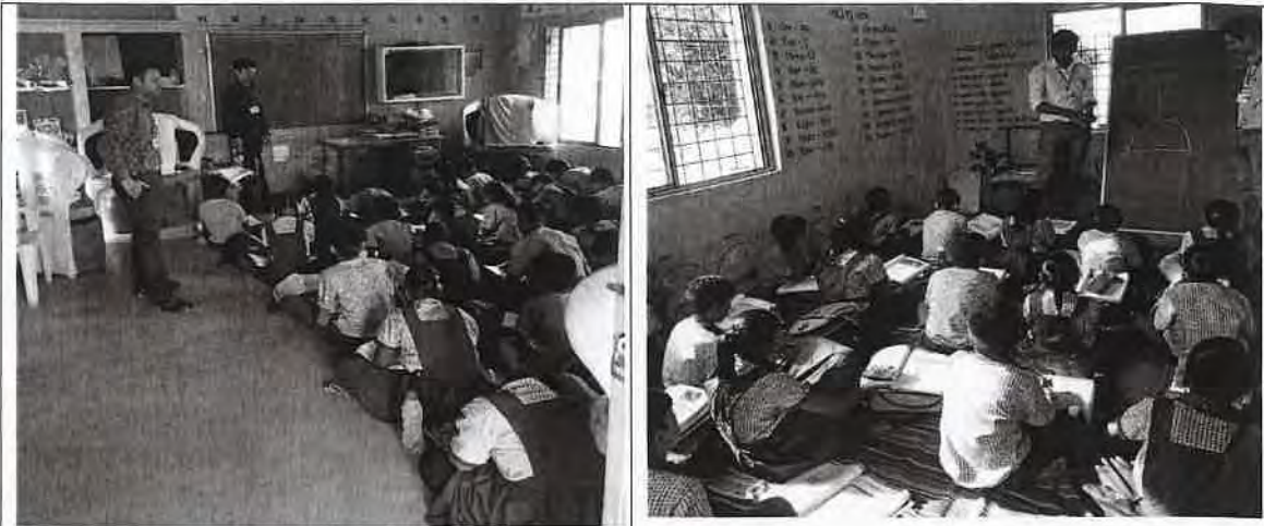
Assessment and Distribution of Aids and Equipments by ALIMCO