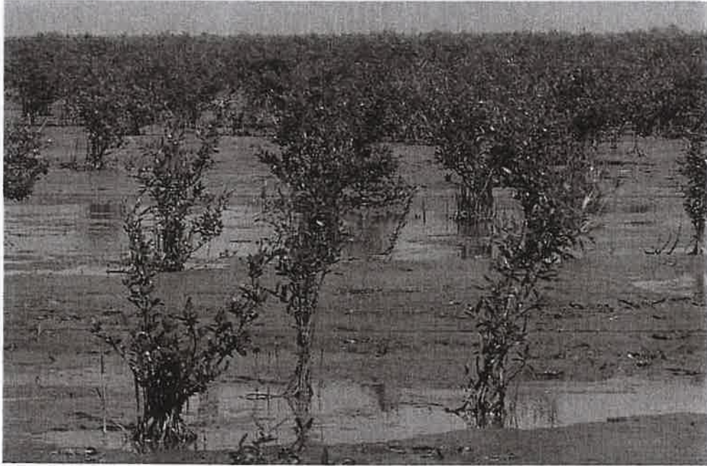
Mangroves planted in 50 ha. area at at Kentiyajal Coast during 2014-15