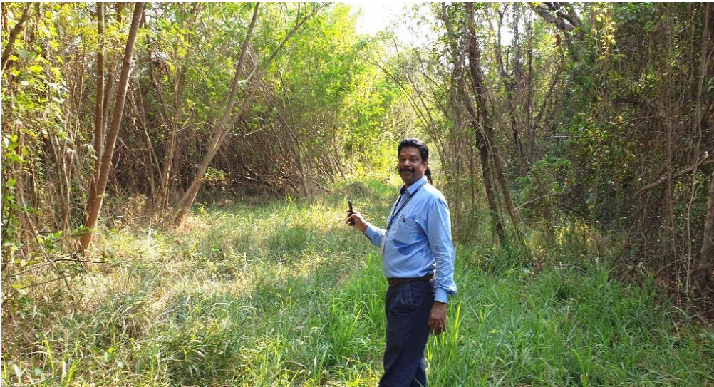
3. Nursery inspection carried out by PLL EMC along with Social Forestry officials on 06.08.2019