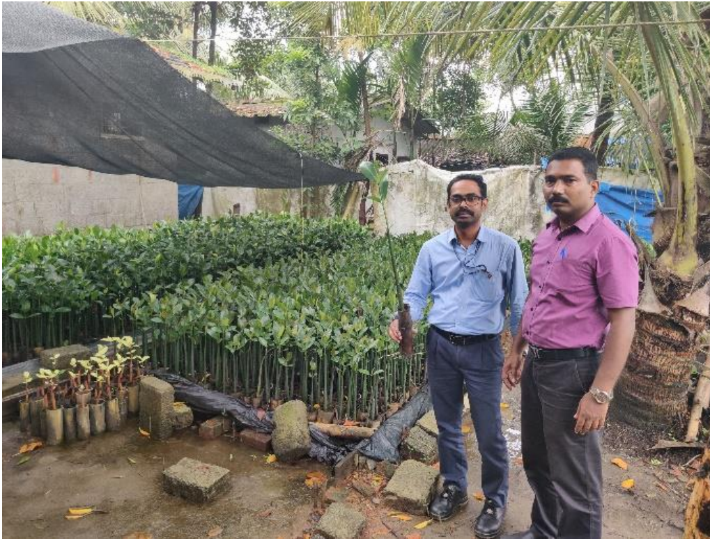
4. Inspection carried out by PLL EMC along with social forestry officials at mangrove afforestation site on 30.01.2020