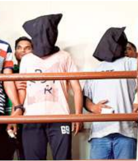
The two were on their way to Gujarat after reaching Shahjahanpur.