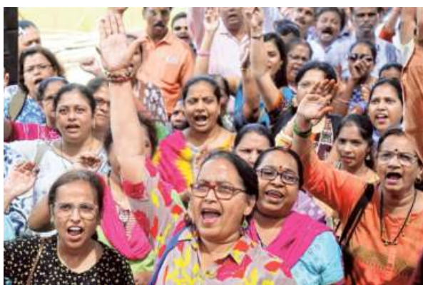
Bank employees taking part in the strike at Azad Maidan in Mumbai on Tuesday.