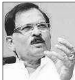
Naik is asymptomatic and will isolate himself at home.