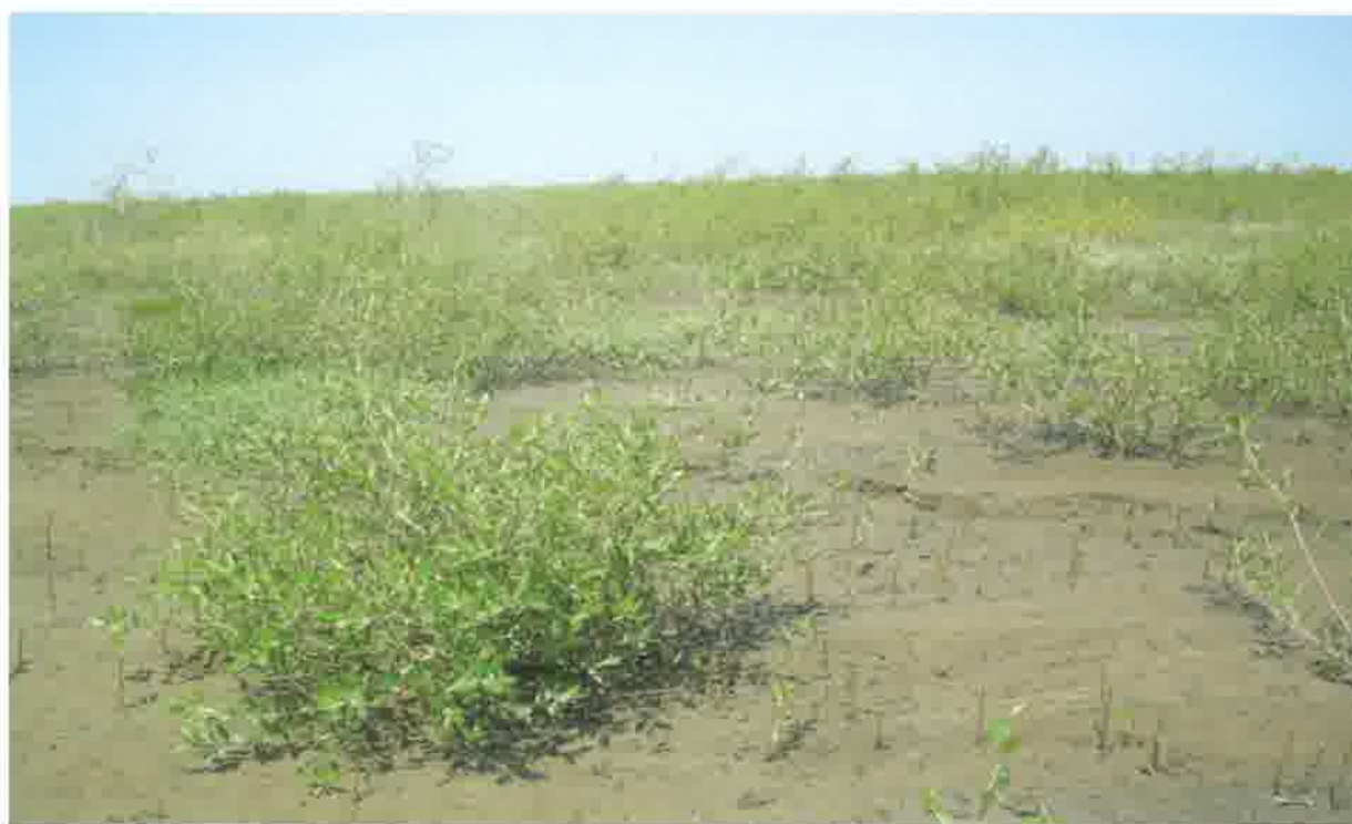
Mangroves developed through Transplantation Method Dahej, 2008-09 Status as on May 2012