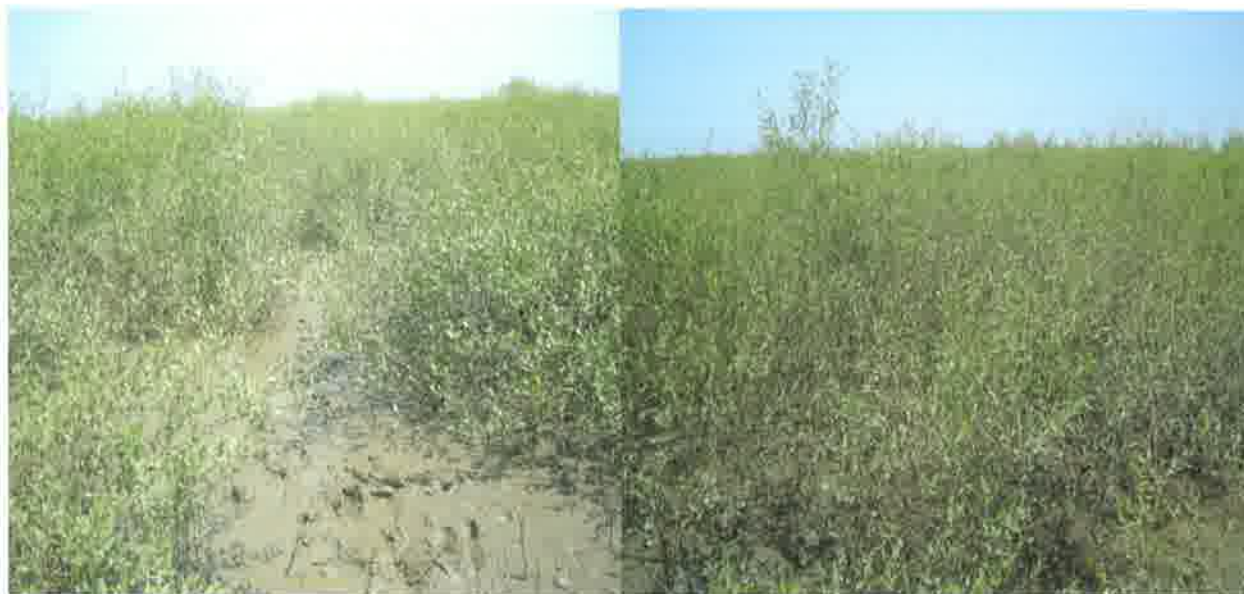
Mangroves developed through Transplantation Method Dahej, 2008-09 Status as on May 2012