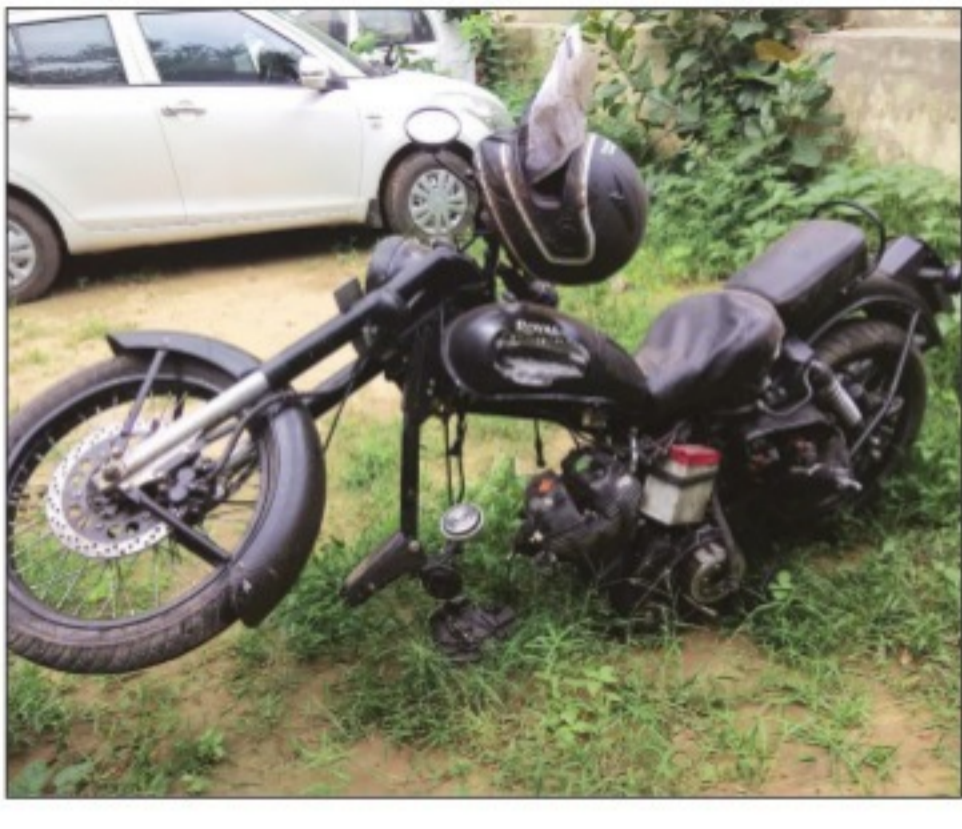
The mangled remains of the motorcycle on which the two were travelling.

"The two were travelling on Golf Course road, with Martin driving the Bullet motorcycle and Kant riding pillion. The bike collided with a jersey barrier near the Genpact underpass," said Subhash Boken, PRO of Gurgaon police. "The front of the vehicle was completely shattered, indicating that they were probably travelling at a high speed. We suspect Martin lost control of the vehicle," he said.