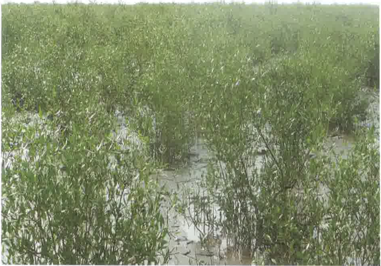
Mangroves planted in 50 ha. area at NADA Coast during 2009-10