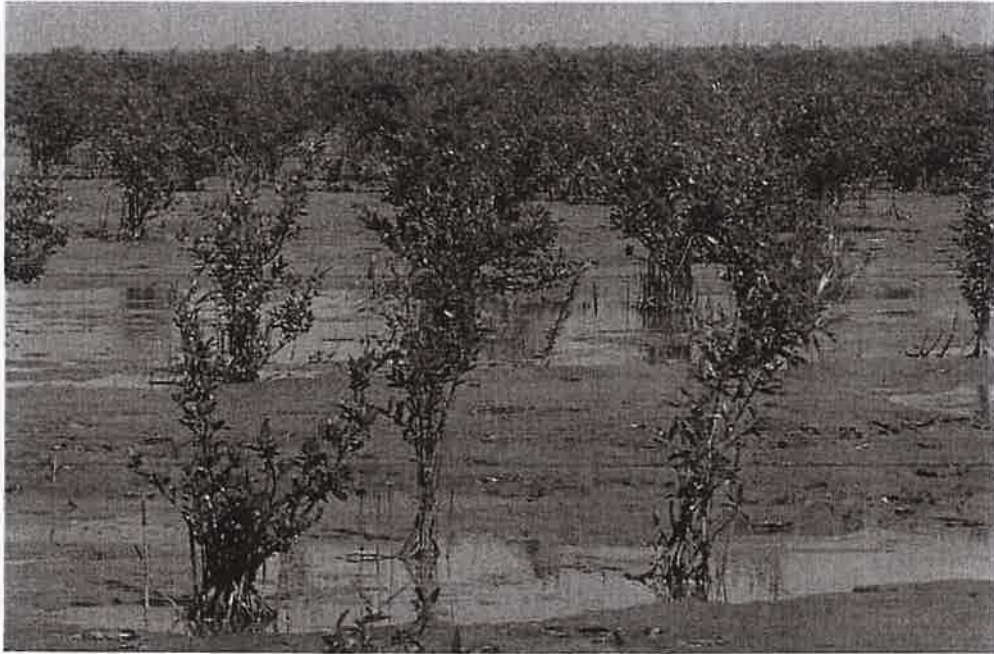
Mangroves planted in 50 ha. area at at Kentiyajal Coast during 2014-15