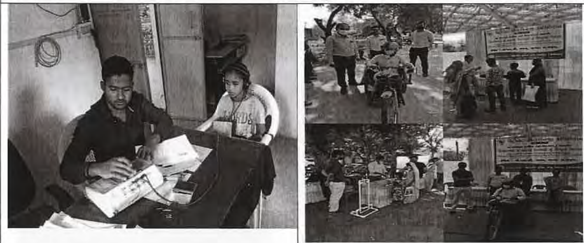
Distribution of Ration Kit to Contract Labour Community around PLL Dahej Terminal during COVID-19 outbreak.