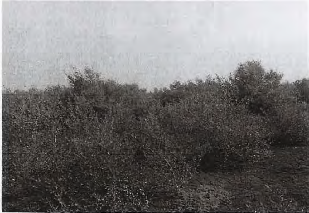
Mangroves planted in 200 ha. area at Ankalva Coast during 2012-13