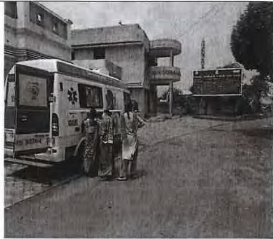
Distribution of PPE Kits and Masks in partnership with Rotary Club of Pune and Dahej