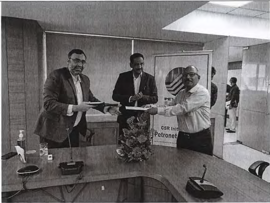
Flood Relief Activities