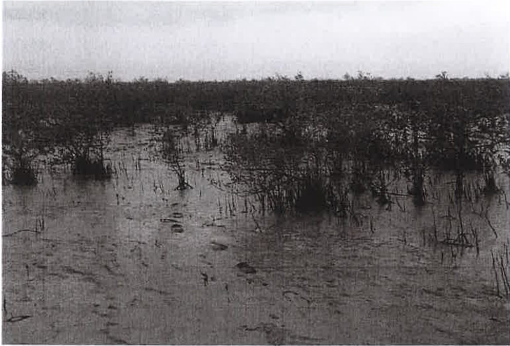
Mangroves planted in 50 ha. area at Gadhula, Talaja Coast during 2016-17