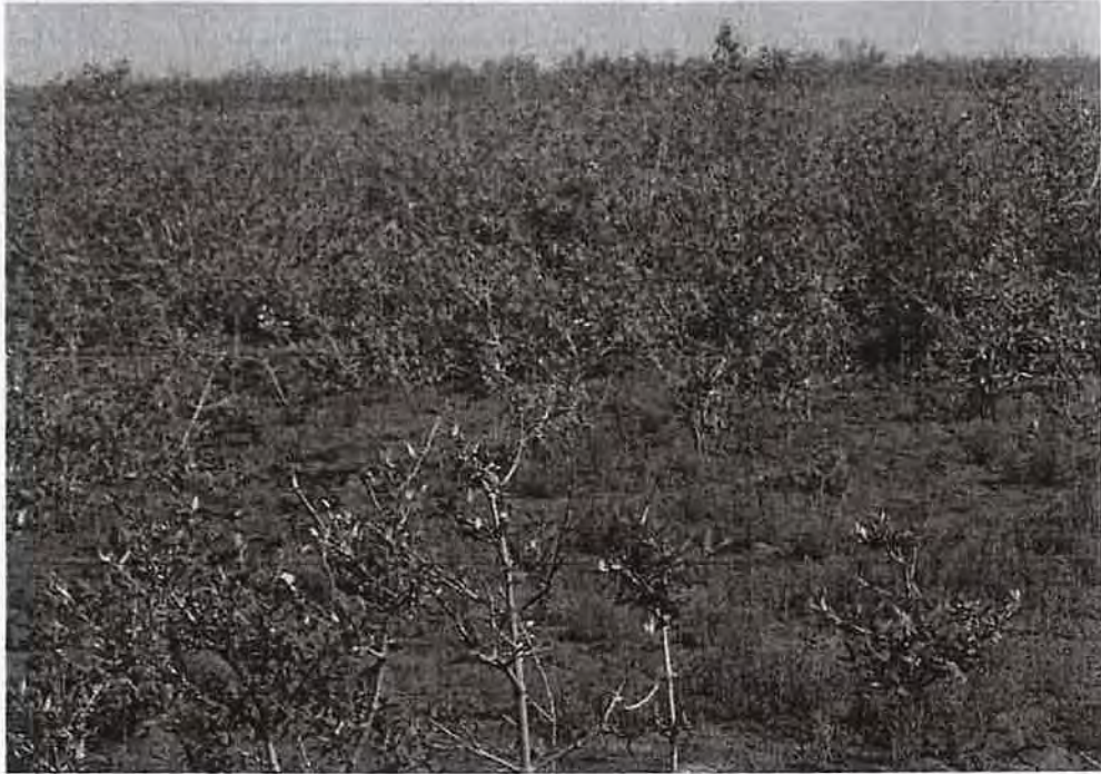
Mangroves planted in 200 ha. area at Bhavnagar Coast during 2013-14