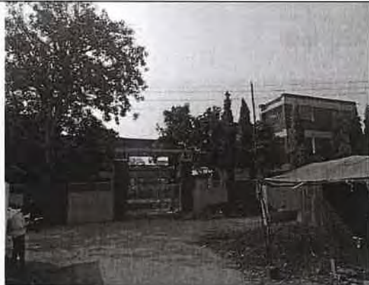
Development of Primary School at Luvara Village

PLL has signed a new agreement with CIPET, Ahmedabad to train 400 candidates in CNC Machine and Plastic Product Manufacturing. First batch of 50 candidate enrolled and initiated. PLL has signed agreement with Bharuch Nagarpalika to provide support for Disaster Management and Swachh Bharat Abhiyan, Bharuch Nagarpalika would procure one fire tender and Road sweeping machine with the financial support of Rs. 1.93 Cr. under PLL CSR Initiatives. PLL has signed an agreement with Gujarat CSR Authority (GCSRA) for construction of Panchayat Bhavan at Lakhigam village with financial support of Rs. 1.13 Crs.. PLL has supported Development of Green Zone beneath newly constructed flyover bridge at Bharuch City with financial support of Rs. 5.00 lakhs. PLL has supported development of Sports facility by Police Department, Bharuch with financial support of Rs. 5.00 lakh. PLL has supported Medical Equipments to Kasturba Hospital, Seva Rural Jhagadia with financial support of Rs. 5.00 lakh. PLL has provided support to Seva Yagaya Samiti for Strengthening of Facilities for Orphan/destitute Old Age Patients at Civil Hospital, Bharuch for Rs. 5.00 lakh. PLL has partnered with National Youth Foundation to Support for School Health Check-Up Program' at 48 Schools of Vagra Taluka, Dist. Bharuch Gujarat for Rs. 19.92 lakh.