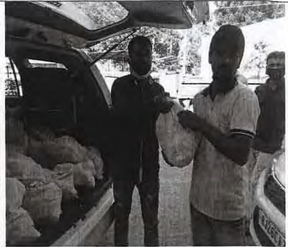
Distribution of Cotton Mask made by women welfare NGOs to prevent infection of COVID-19