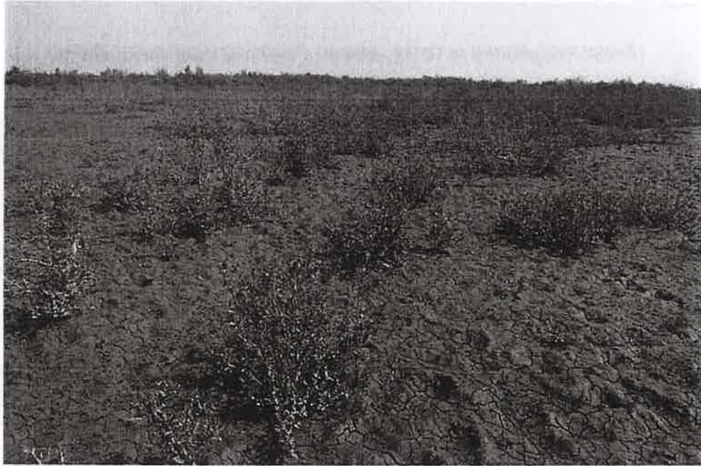
Mangroves planted in 200 ha. area at Bhavnagar Coast during 2014-15