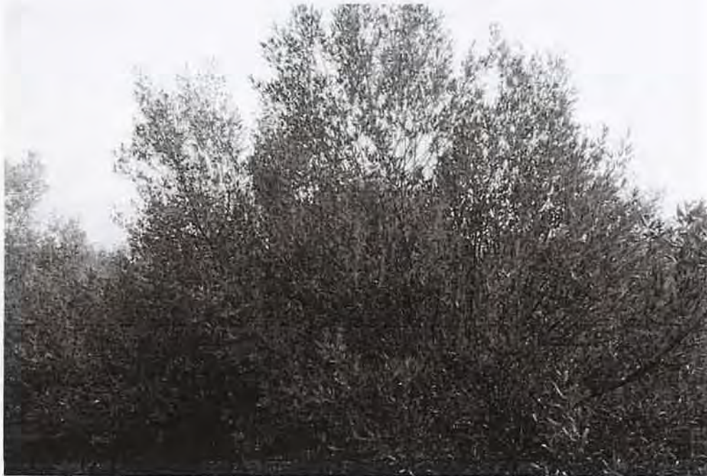
Mangroves planted in 100 ha. area at Ankalva Coast during 2010-11