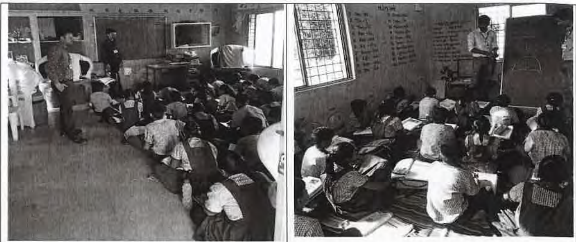
Assessment and Distribution of Aids and Equipments by ALIMCO