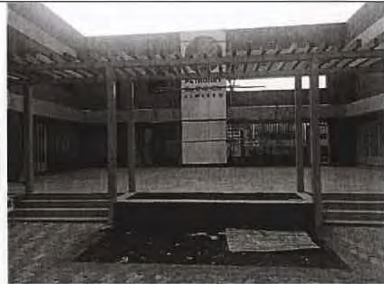
Construction of Panchayat Bhavan at Lakhigam