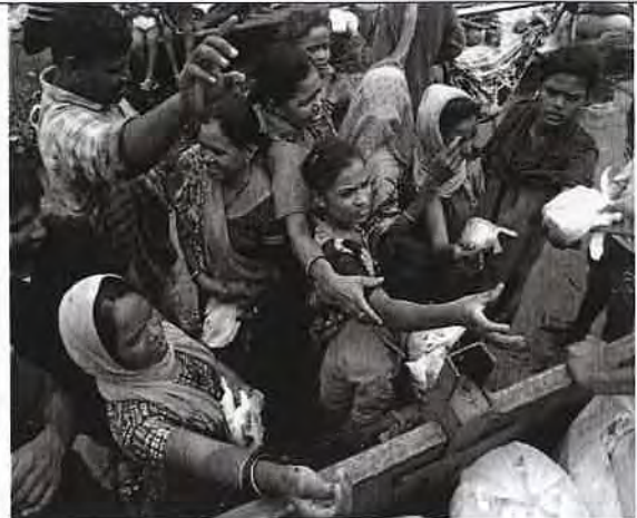
Volunteer Service by PLL Apprentice