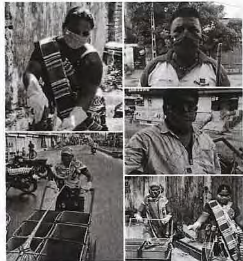
Mobile Health Unit (MHU) (Wockhardt Foundation)