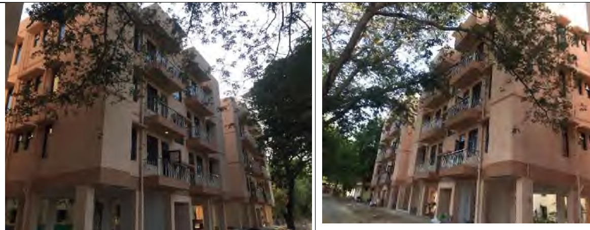
Construction of Primary School Luvara Village