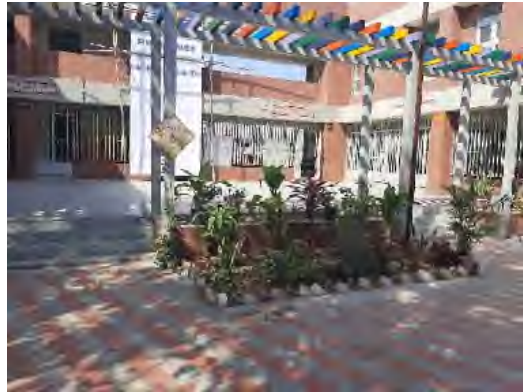
Kaushal Setu Skill Training – CIPET Ahmedabad, MOA Signed (P-III)