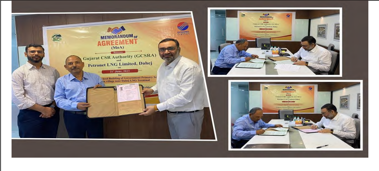
Safety Awareness at Luvara Village