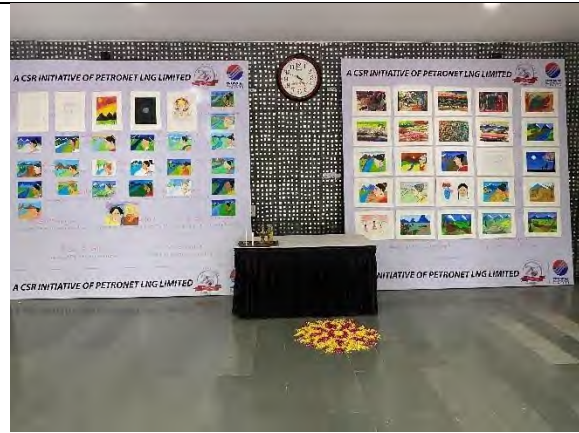
Har Ghar Tiranga Celebrations