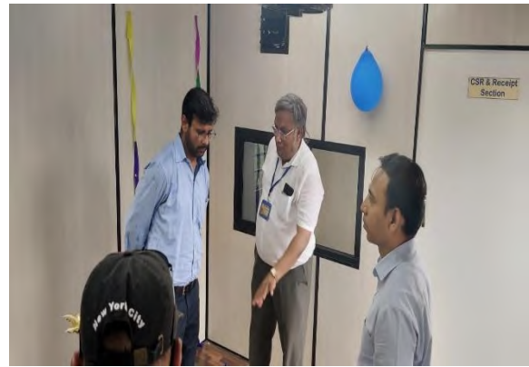
Visit of Ashmita Vikas Kendra, Tralsa