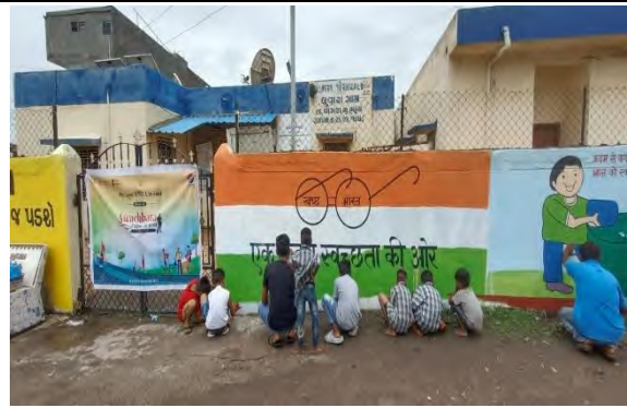
Swachhta Hi Seva - 2023