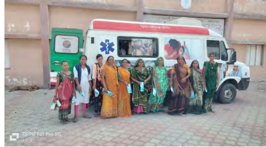
Ekal on Wheel, Ekal Gramothan Foundation