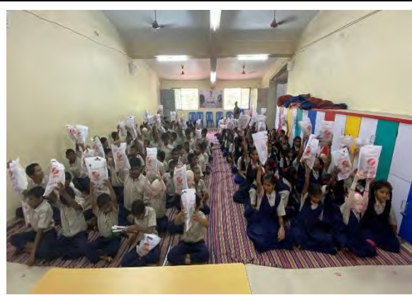
Certificate Distribution for NHFDC Skill Training for Disables