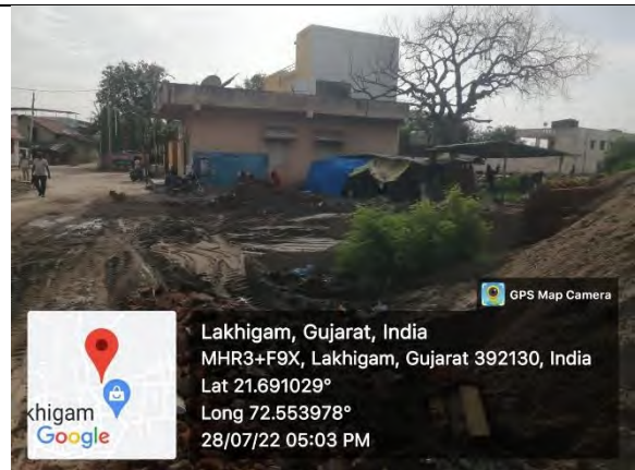
Visit of IIT-Gandhinagar