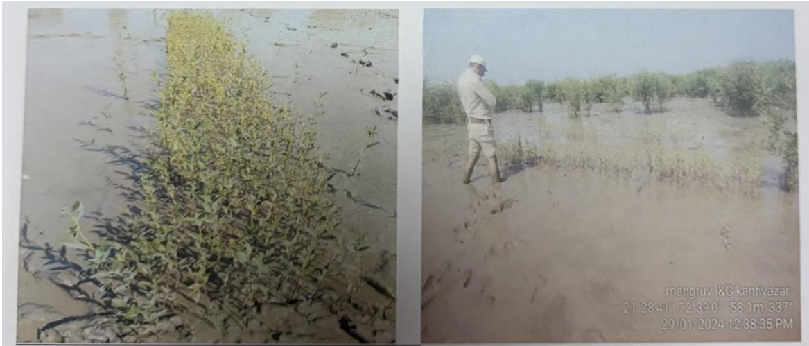
Mangroves planted in 100 ha. area at at Paniyadra Coast during 2023-24