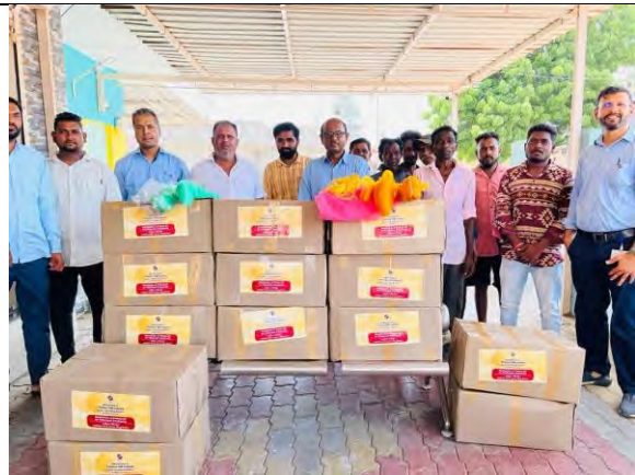
MoA for Construction of Govt. Primary School, Lakhigam Village