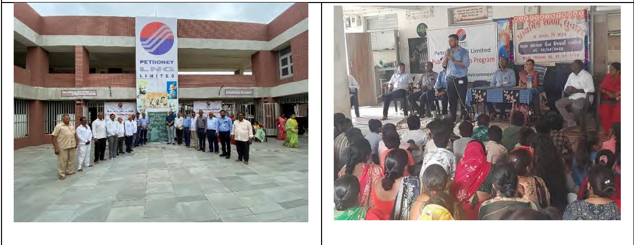
Redevelopment of Pond at Luvara Village