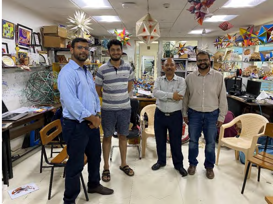
Skill Development Workshop on for promotion of Art & Culture