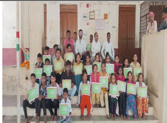
TB Mukat Bharat Abhiyan