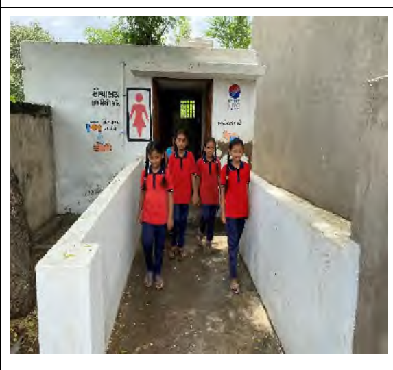
Closing Ceremony Swachhata Pakhwada – 2024