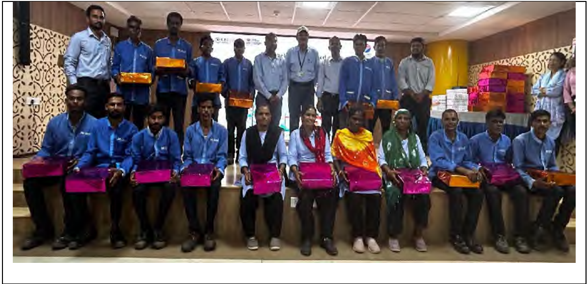
Kaushal Setu Skill Training – CIPET Ahmedabad, MOA Signed (P-IV)