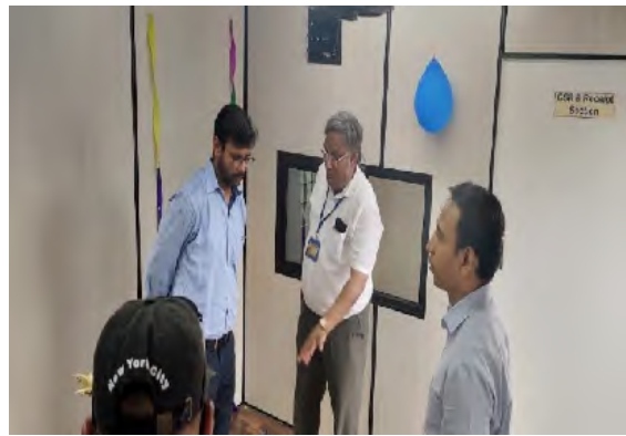
Visit of Ashmita Vikas Kendra, Tralsa