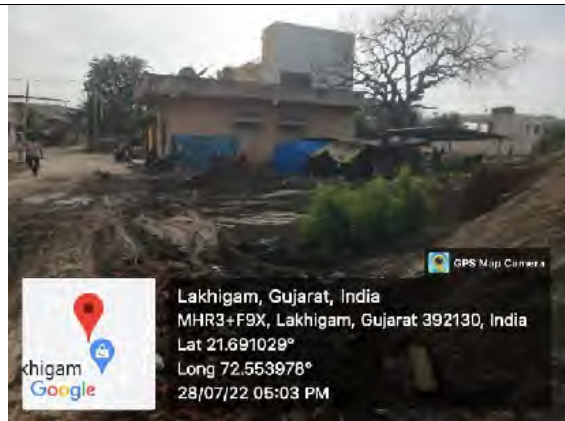
Visit of IIT-Gandhinagar