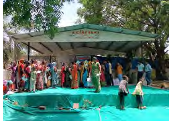
Development of recreation area (Garden) at Luvara Village