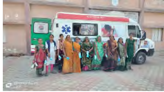
Ekal on Wheel, Ekal Gramothan Foundation