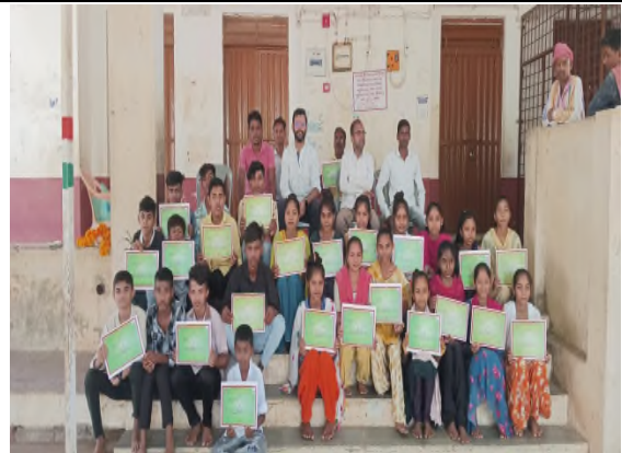
TB Mukt Bharat Abhiyan