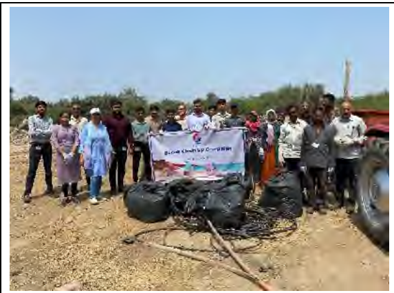
Beach Cleanup Drive 04.07.2024