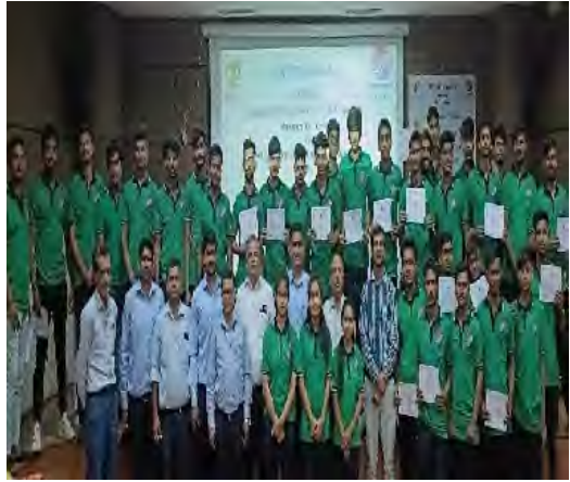
Mobile Health Unit (MHU) (Wockhardt Foundation)