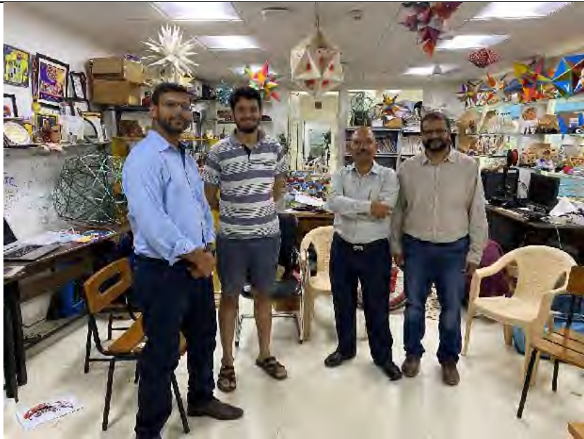
Skill Development Workshop on for promotion of Art & Culture