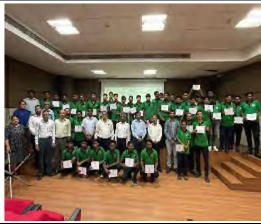
Mobile Health Unit (MHU) (Wockhardt Foundation)