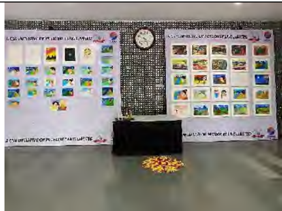
Har Ghar Tiranga Celebrations