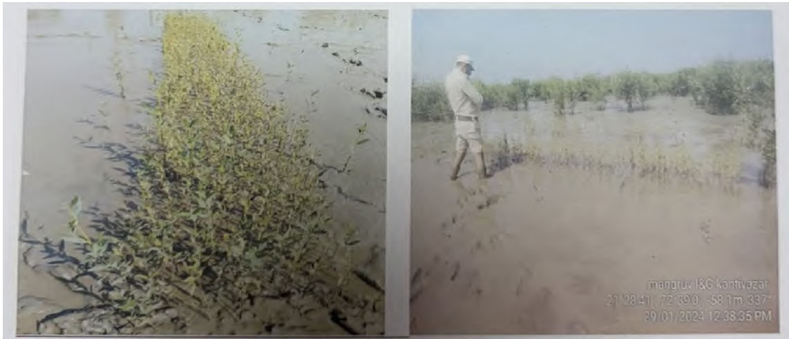
Mangroves planted in 100 ha. area at at Paniyadra Coast during 2023-24