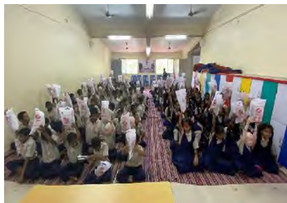
Certificate Distribution for NHFDC Skill Training for Disables