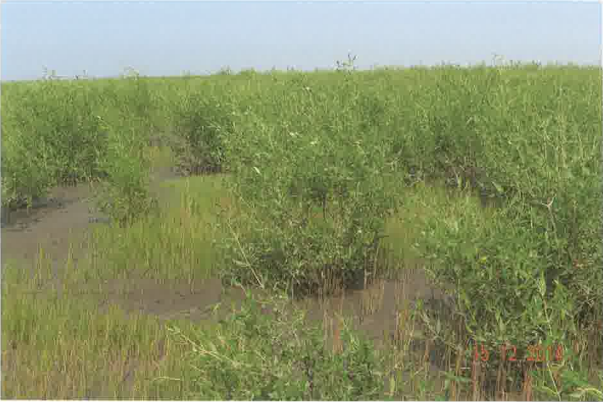
Mangrove Plantation (50 ha.) at Nada Coast during 2009-10