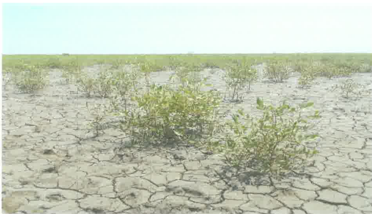
Mangroves planted in 200 ha. area at Bhavnagar Coast during 2013-14