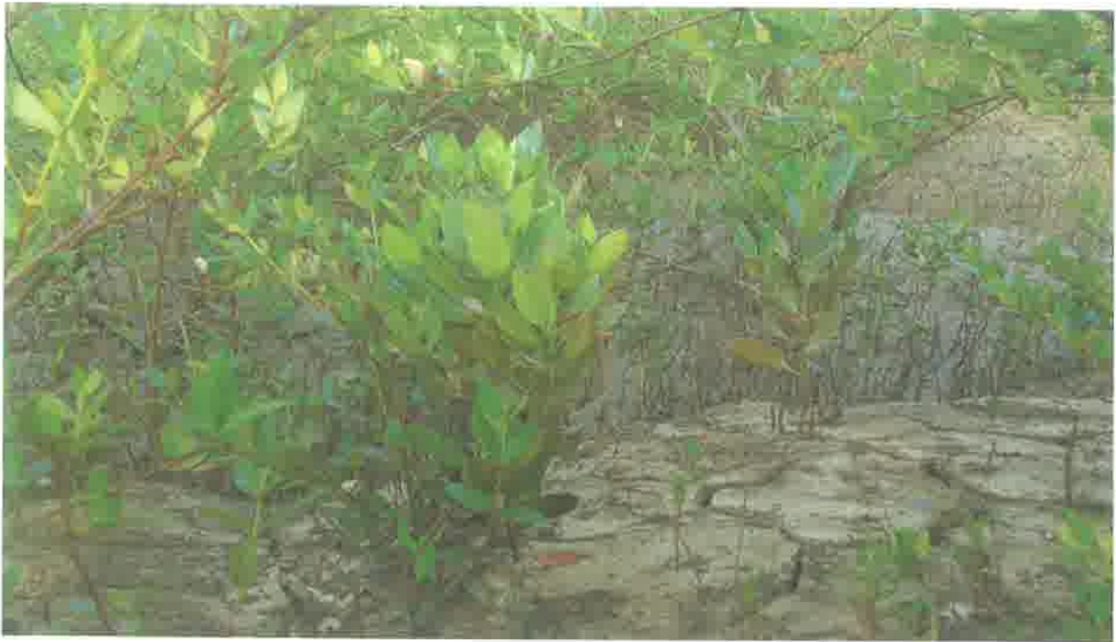
Mangroves planted in 200 ha. area at Ankalva Coast during 2012-13