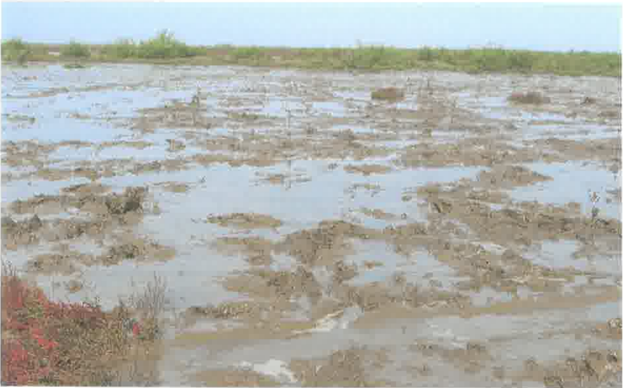
Mangroves plantation activities in 50 ha. area at Kentiyajal Coast during 2014-15