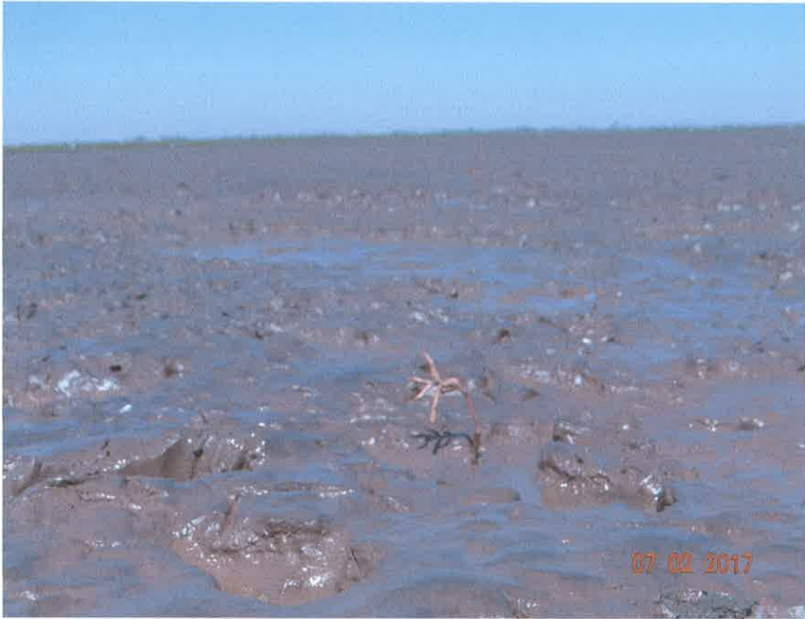
Mangroves planted in 50 ha. area at Gadhula, Talaja, BVNR, during 2016-17