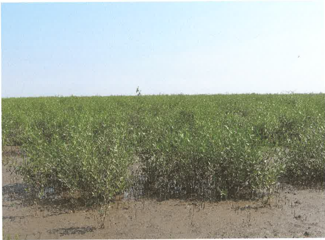
Mangroves planted in 50 ha. area at NADA Coast during 2009-10