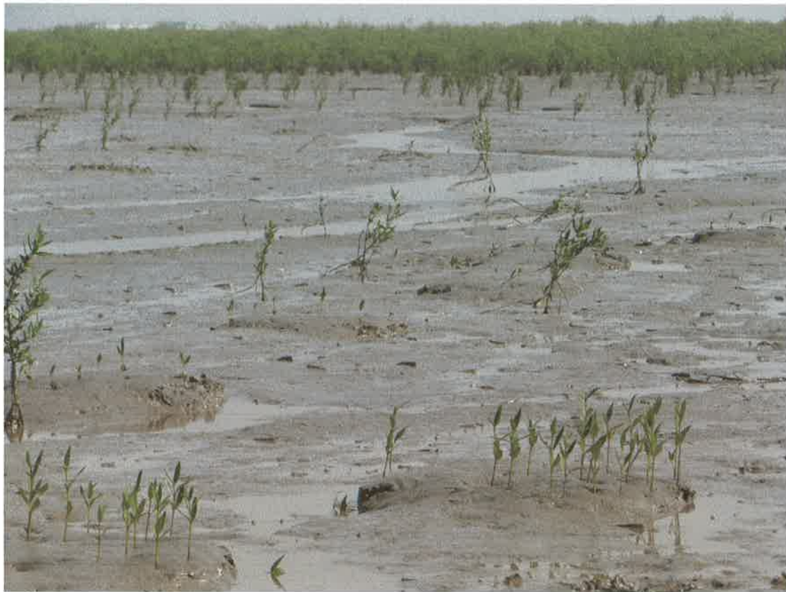
Mangroves plantation planted in 50 ha. area at Kentiyajal Coast during 2014-15