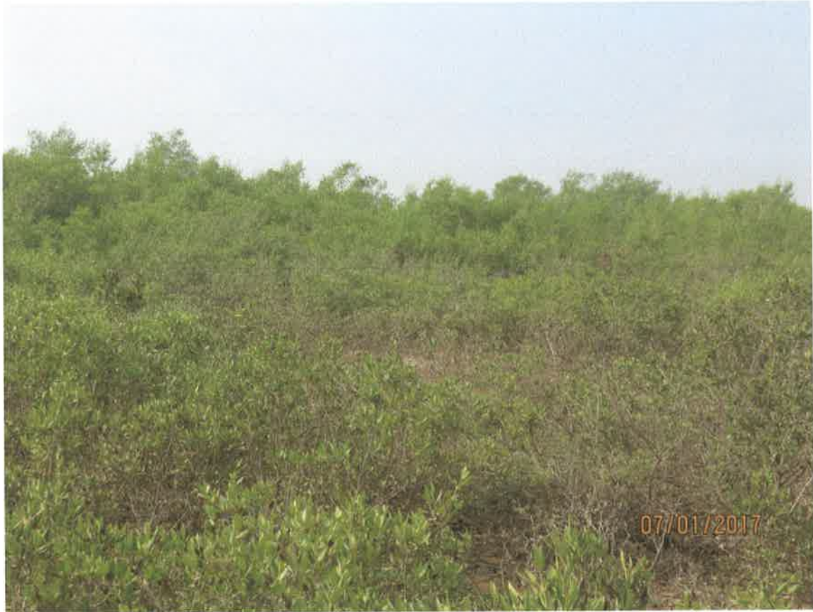
Mangroves planted in 200 ha. area at Ankalva Coast during 2012-13