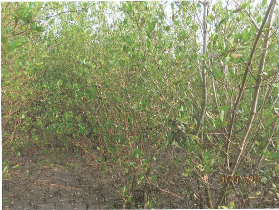
Mangroves planted in 100 ha. area at Ankalva Coast during 2010-11