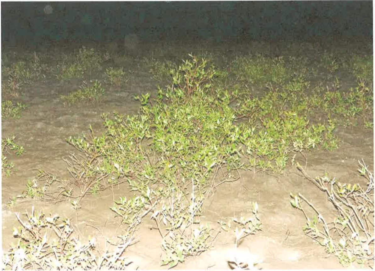
Mangroves planted in 100 ha. area at Bhavnagar Coast during 2012-13