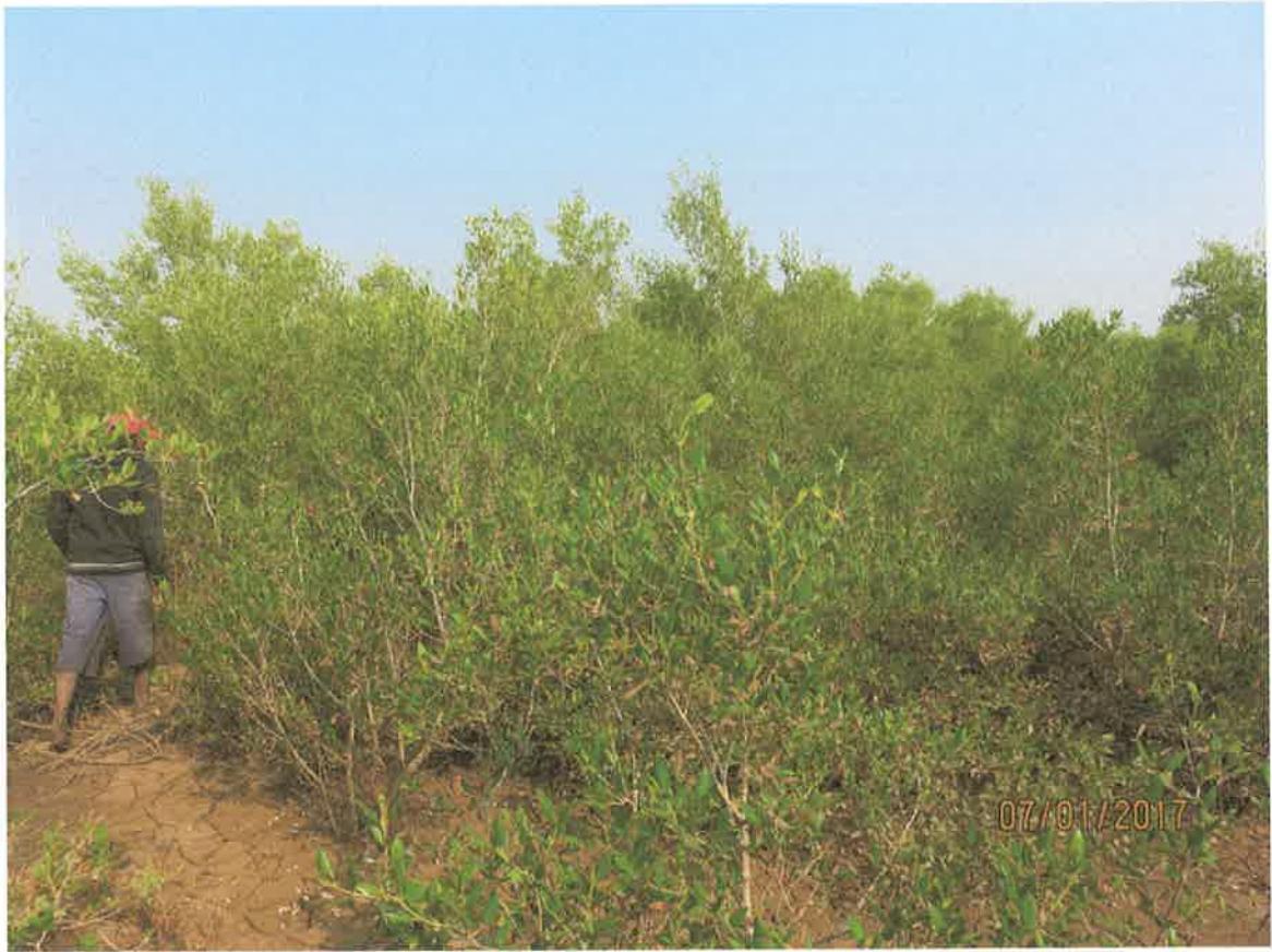
Mangroves planted in 200 ha. area at Ankalva Coast during 2011-12