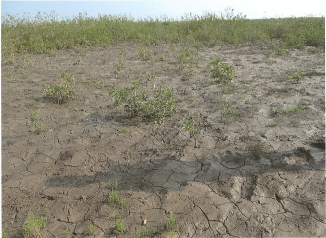
Mangroves planted in 200 ha. area at Bhavnagar Coast during 2013-14