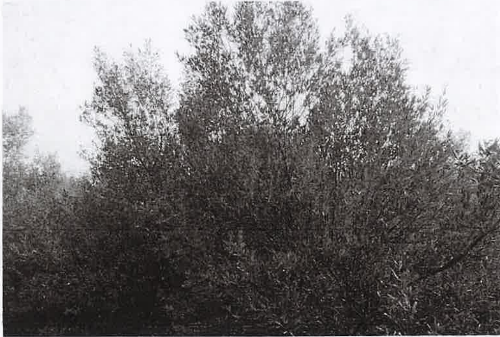
Mangroves planted in 100 ha. area at Ankalva Coast during 2010-11