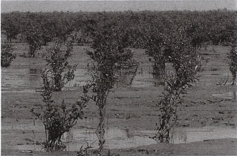
Mangroves planted in 50 ha. area at at Kentiyajal Coast during 2014-15