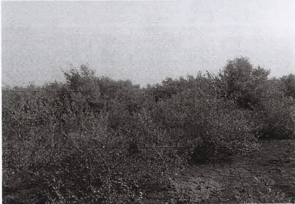
Mangroves planted in 200 ha. area at Ankalva Coast during 2012-13