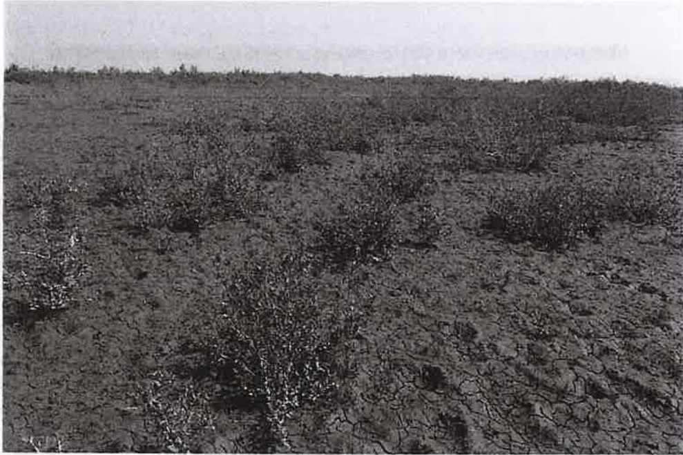
Mangroves planted in 200 ha. area at Bhavnagar Coast during 2014-15